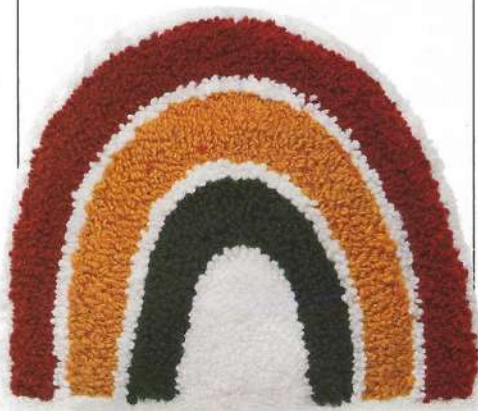
Rainbow 8" x 10" acrylic and wool pillow, $70, theclutteredwall.etsy.com