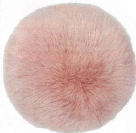
Lanna 16"-diameter sheepskin pillow in pink, $49, article.com