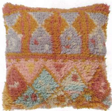
Desert at Dusk 19 3/4" x 19 3/4" wool pillow, $85, kipandco.com