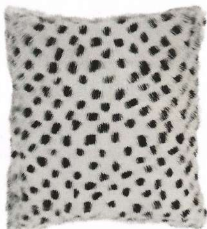
15 3/4" x 15 3/4" goat-hair pillow, $68, meadowblu.com