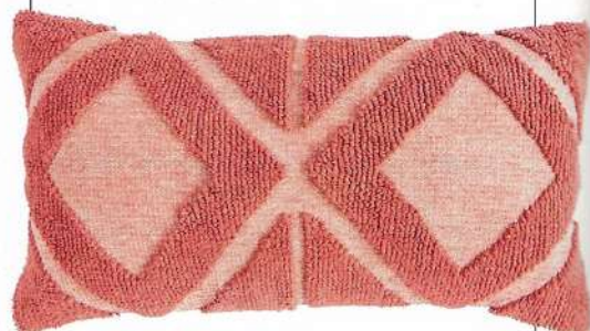
Ridley 14" x 24" cotton-blend pillow in coral, $33, jossandmain.com