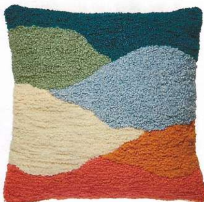
Gradient 18" x 18" acrylic pillow cover, $85, shopthreadhaven.etsy.com