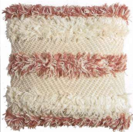
Kolkata 17" x 17" wool-blend pillow, $60, modshop1.com